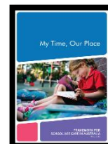
My Time, Our Place; Framework for School Age Care in Australia 2022 V2

Critical reflection: is a meaning-making process that assists informing future practice in ways that demonstrate an understanding of each child’s learning, development and wellbeing and implications for equity and social justice. It involves examining and analysing events, experiences and practices from a range of perspectives to inform future planning and decision-making ( Early Years Learning Framework 2022 V2 – refer to Sources ).